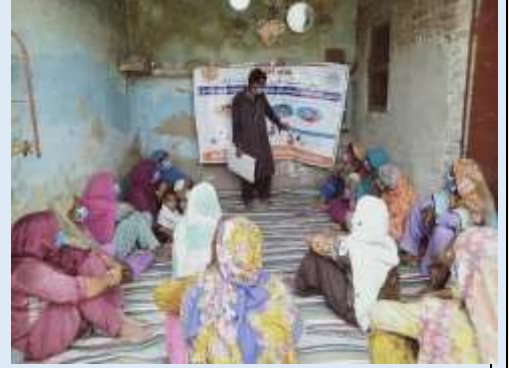
Under PINS-3 Community awareness sessions on COVID-19 at Shikarpur