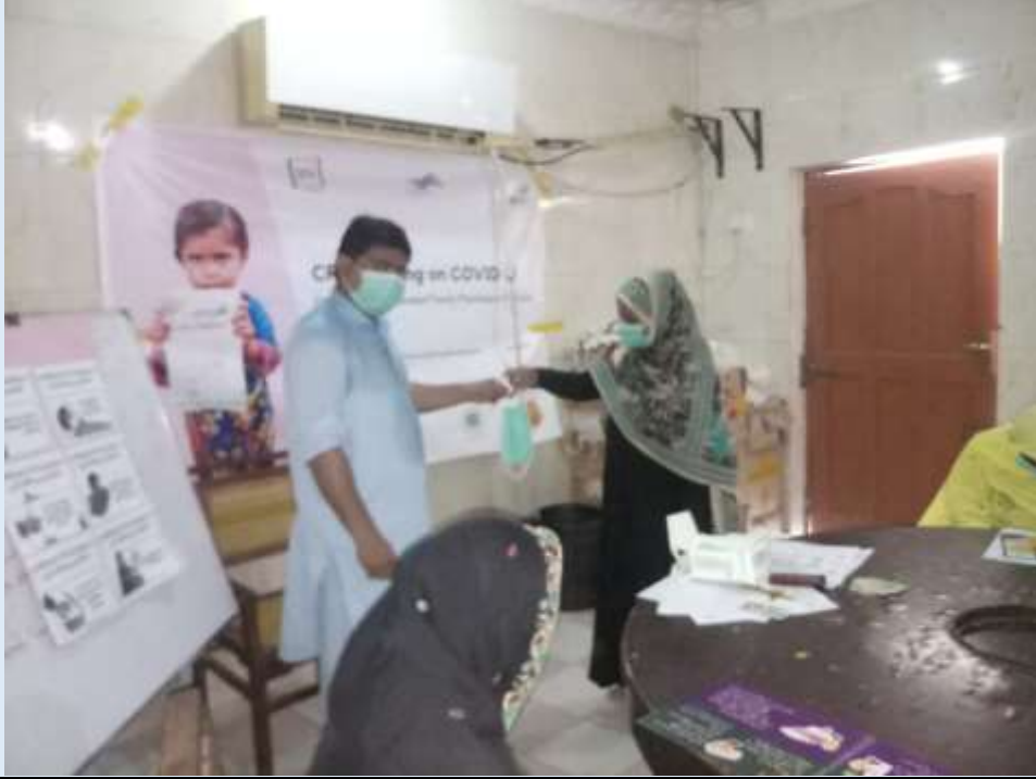
CRPs Training on COVID-19 at District Shikarpur