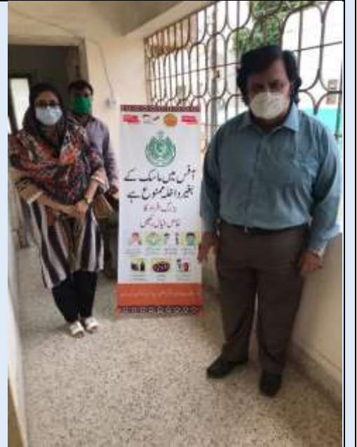
COVID-19 sessions on social-distancing at Matli, Badin