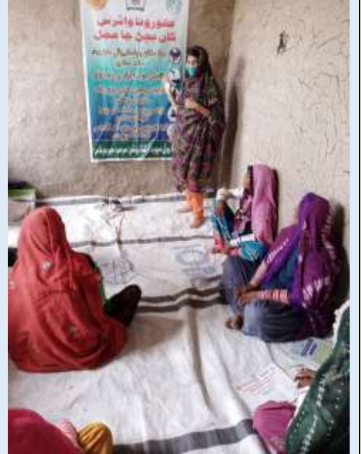
Community based COVID-19 awareness campaigns at District Mirpurkhas