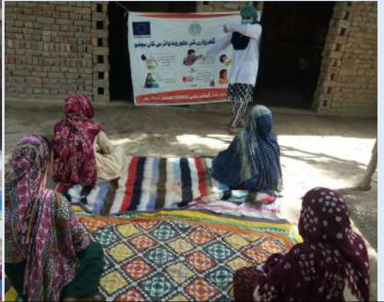
COVID-19 Awareness raising sessions at District Shikarpur